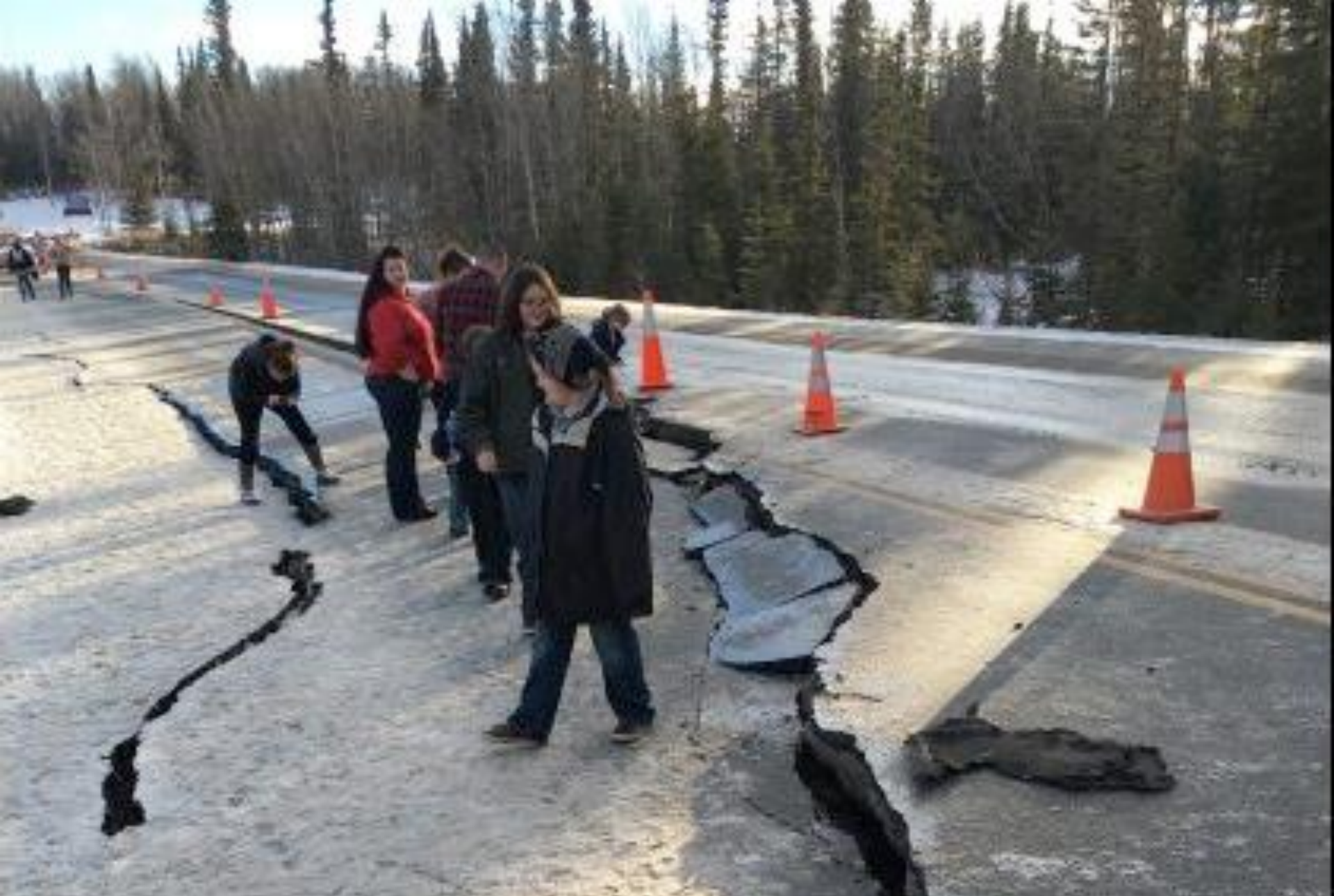
Lateral spreading along Kalifornsky Beach Road, Kenai, Alaska, triggered by the 24 January 2016 M 7.1 Iniskin earthquake