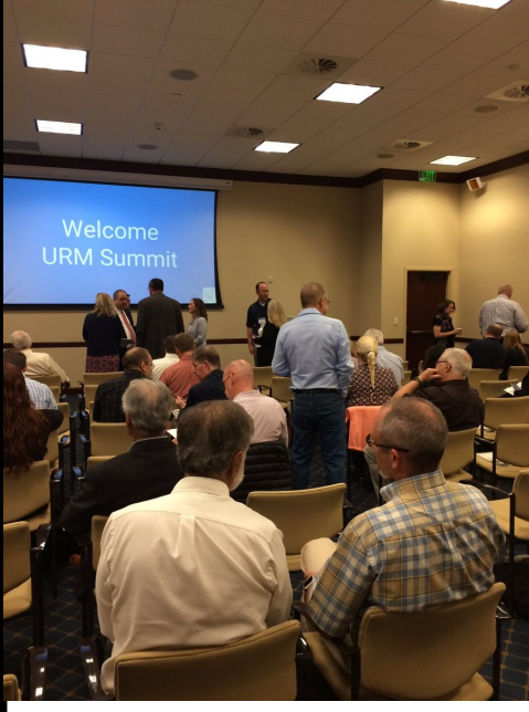
First day of the Utah URM Summit

WSSPC attended the Utah Unreinforced Masonry Summit in Salt Lake City June 25<sup>th</sup>-26<sup>th</sup>. The Summit brought together approximately 100 stakeholders from emergency management, building departments, government, the private sector, and non-profit groups.